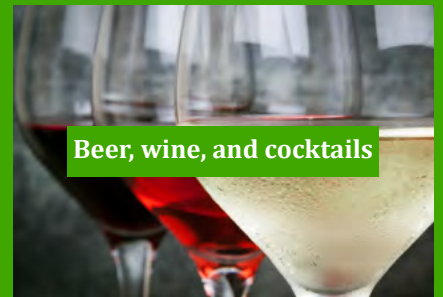
Beer, wine, and cocktails