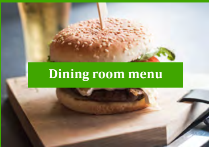
Dining room menu