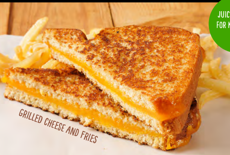
GRILLED CHEESE AND FRIES